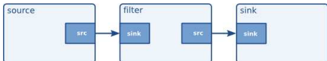
Figure 5-5. Visualisation of three linked elements

By linking these three elements, we have created a very simple chain of elements. The effect of this will be that the output of the source element (“element1”) will be used as input for the filter-like element (“element2”). The filter-like element will do something with the data and send the result to the final sink element (“element3”).