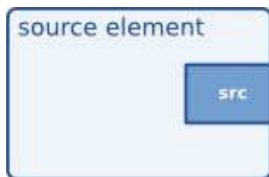
Figure 5-1. Visualisation of a source element

Source elements do not accept data, they only generate data. You can see this in the figure because it only has a source pad (on the right). A source pad can only generate data.